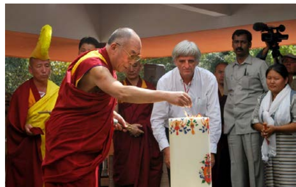
Inauguration of the Pavilion of the Tibetan Culture, 2010

The founder’s vision for the International Zone was that every country with a well-defined culture should build there a national pavilion . Each pavilion will seek to express at the highest level the spirit and culture of the country they represent in form and activities. They will be centres for education and research into the genius of the nation, to encourage a deeper understanding of the various cultures of the world and of our common humanity.